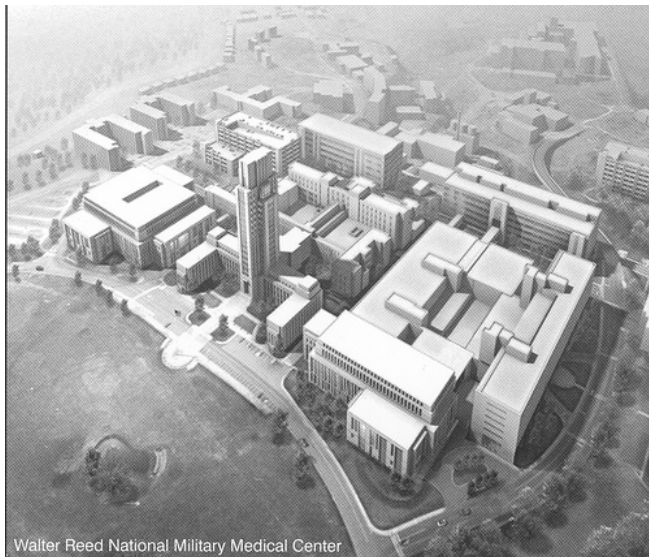
Walter Reed National Military Medical Center